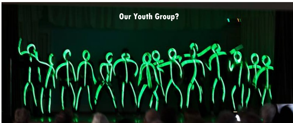
Our Youth Group?