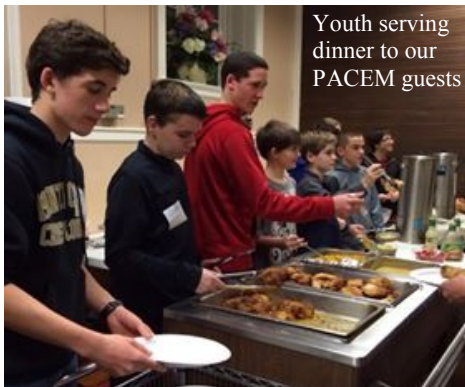
Youth serving dinner to our PACEM guests

Sunday, February 15, the Youth will be meeting at 5:00 pm to cook and serve dinner at the Ronald McDonald House and the Hospitality House.