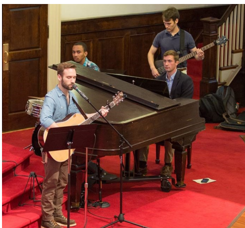
Photo from the college-led worship service April 12, 2015

6:15 Program: Committee Reports: Missions & Ministries, Faith & Justice