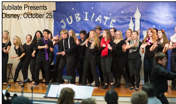
Jubilate Presents Disney, October 25