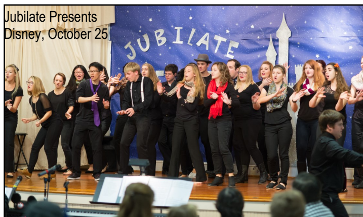
Jubilate Presents Disney, October 25