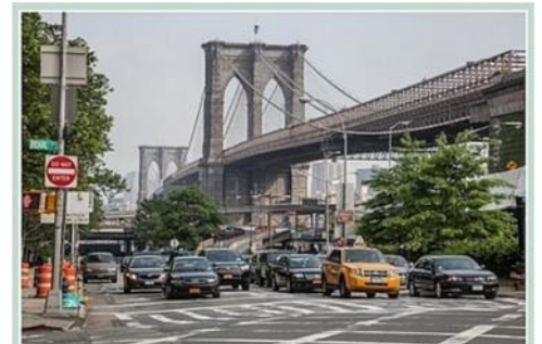
Brooklyn Bridge from Manhattan side