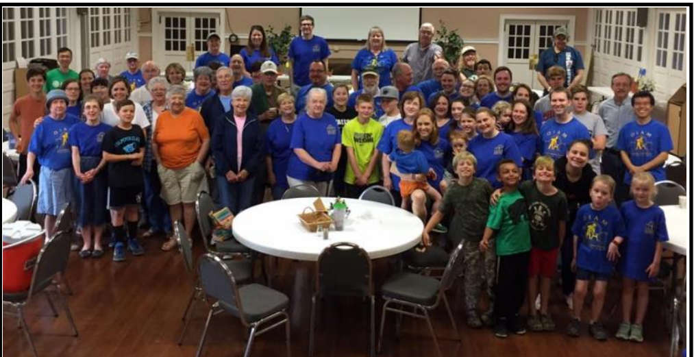
Photos from OIAM (Operation InAsMuch) 2017 at UBC — more can be found on the UBC Facebook page