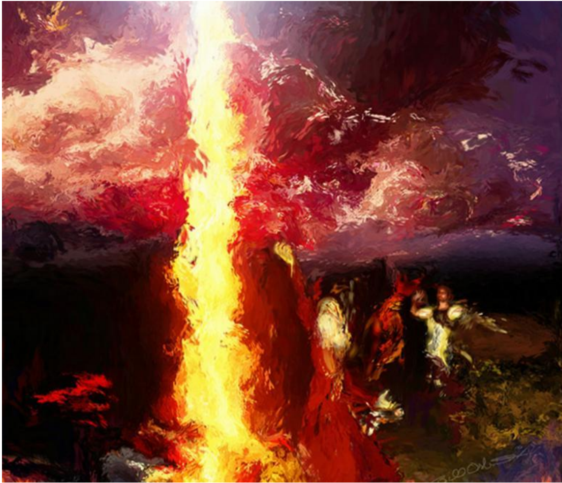
Elijah on Mt. Carmel