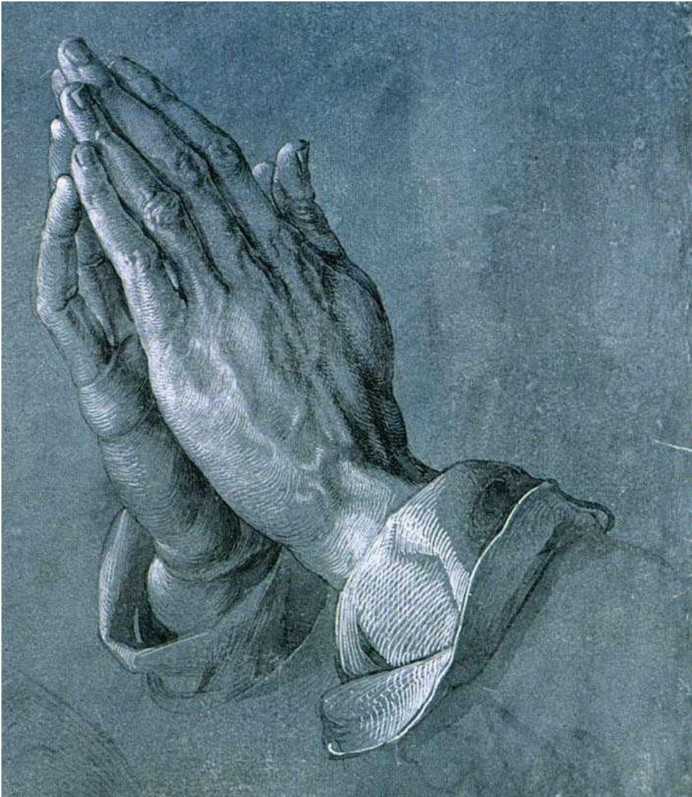
“Hands” - Albrecht Dürer, ca. 1508