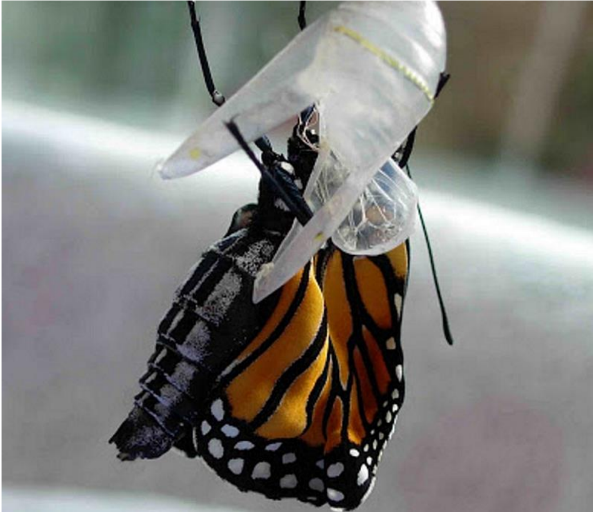
Monarch Butterfly Emerging