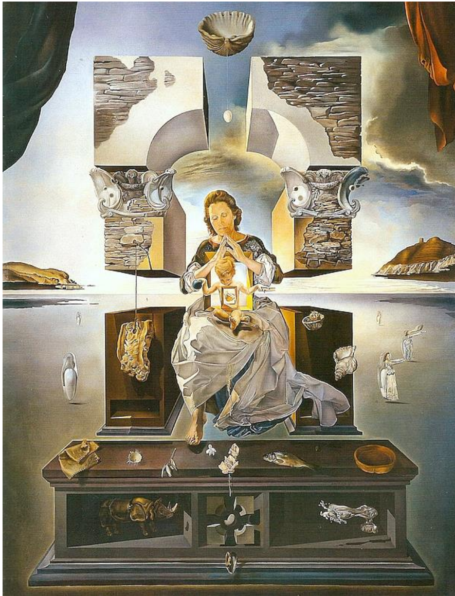
The Madonna of Port Lligat, 1950, Salvador Dalí