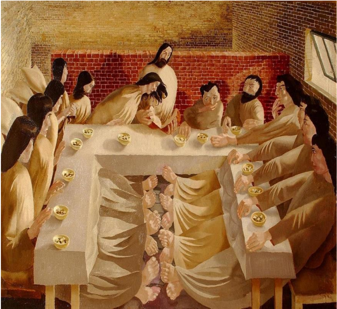
Sir Stanley Spencer, The Lord's Supper , 1920