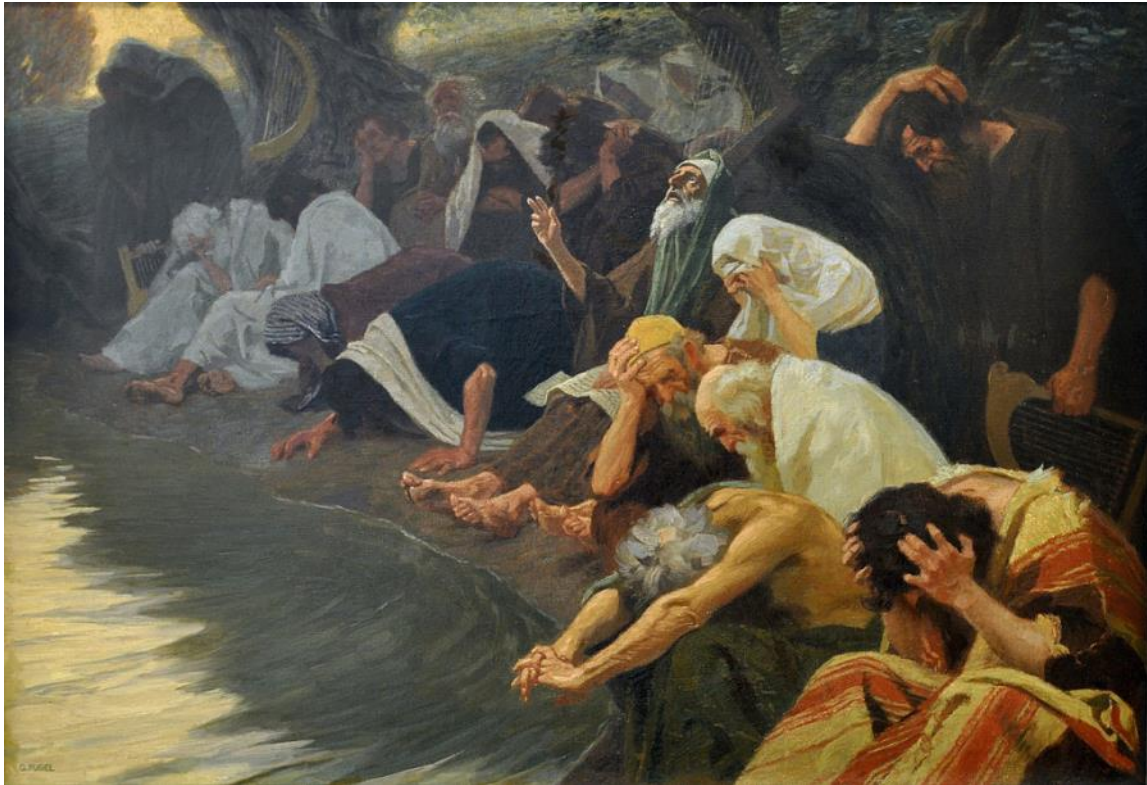
By the rivers of Babylon by Gebhard Fugel, circa 1920