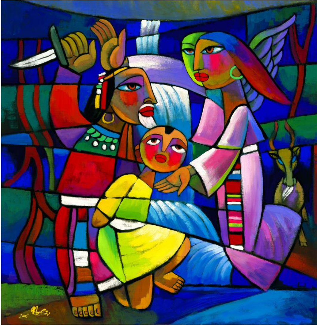
The Sacrifice of Abraham by He Qi