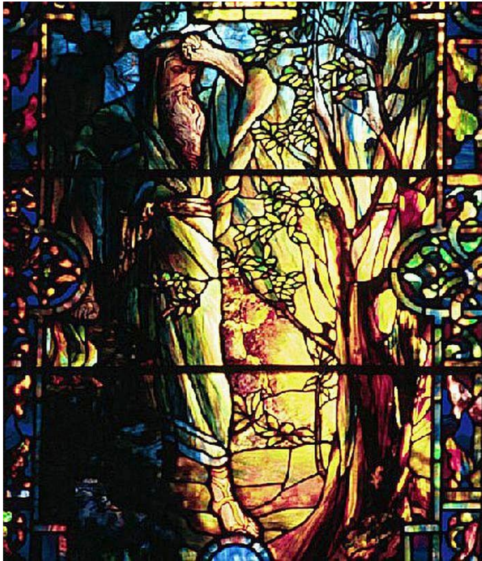
Moses and the Burning Bush Union Congregational Church, Montclair, New Jersey (2004)