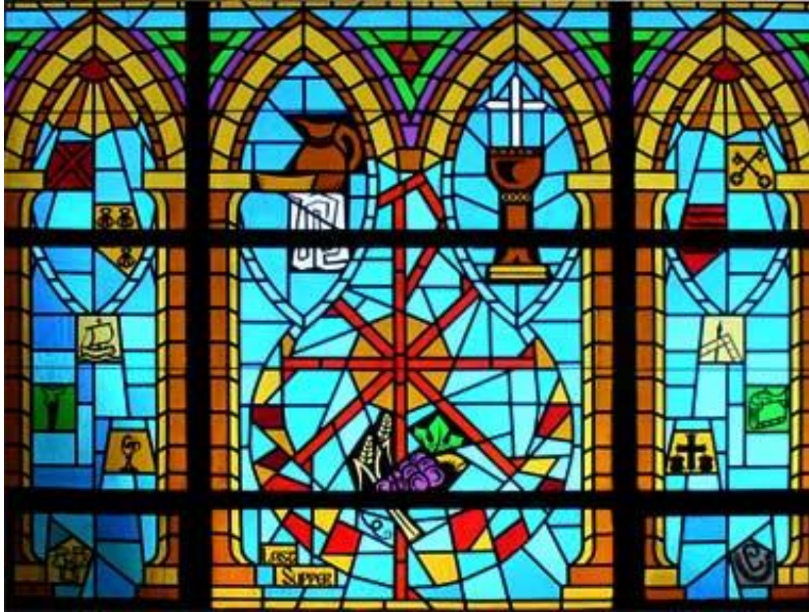
Lord's Supper Ramsay Reformed Church (est. 1887) Titonka, Iowa