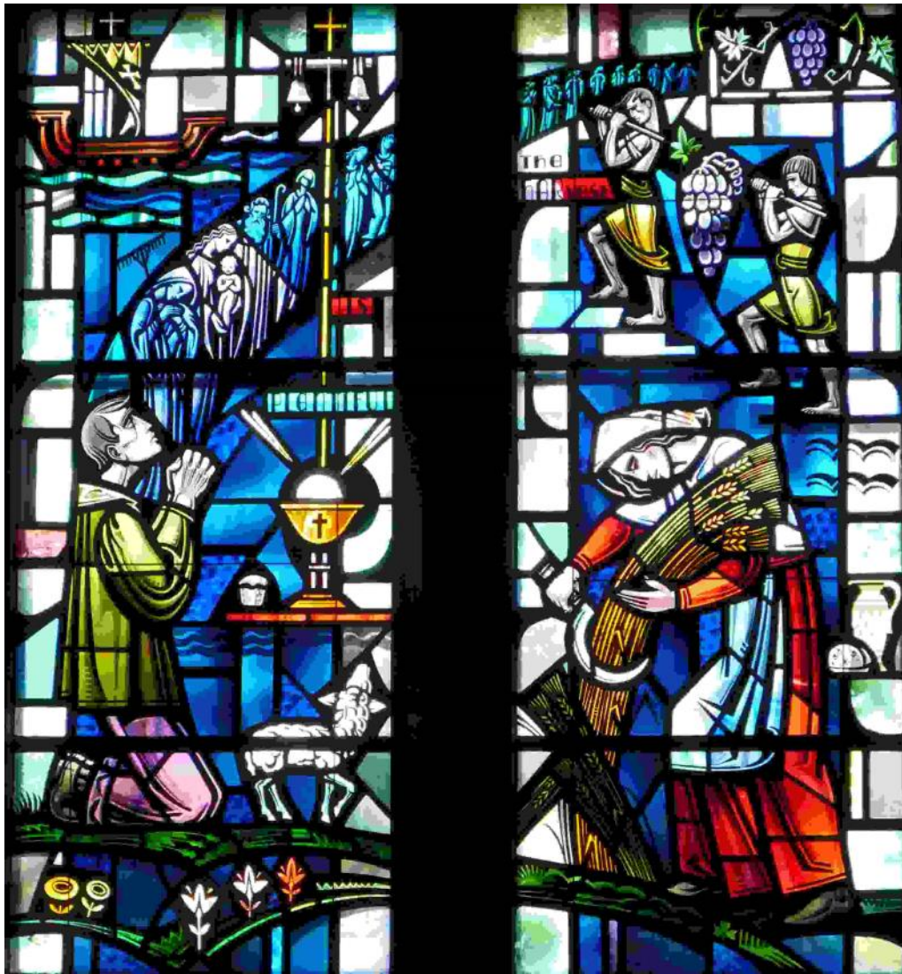
Harvest and Thanksgiving St. Paul's United Church of Christ, St. Paul, Minnesota (1950)