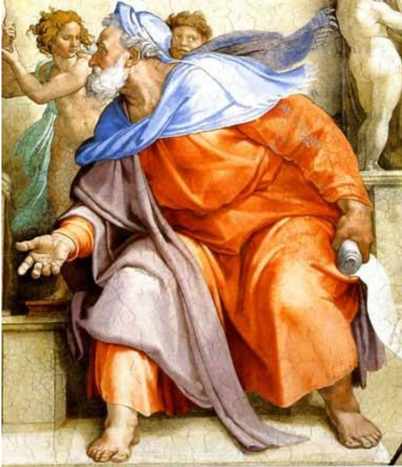
The Prophet Ezekiel Michelangelo (1475-1564) from the Sistine Chapel (1508-1512)