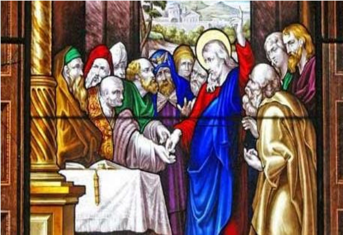
Render unto Caesar St. Chad's Church Shrewsbury, UK (1792) ( The original building was erected in the 13 th century.)