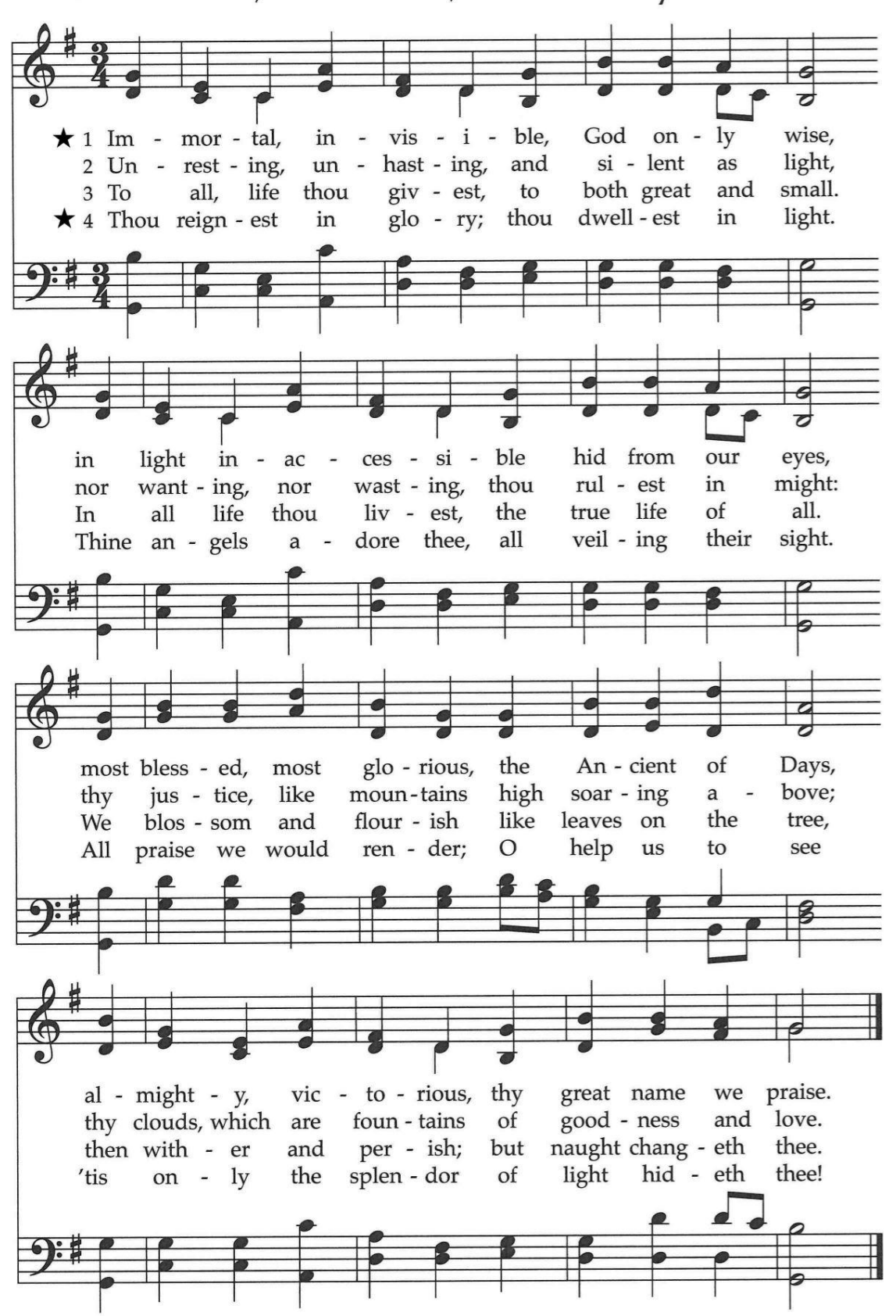
The opening line of this hymn was inspired by the three divine attributes listed in 1 Timothy 1:17 (King James Version), and it continues by considering how God's life exceeds our own finite existence. The text is well set to a Welsh melody shaped by many three-note units.