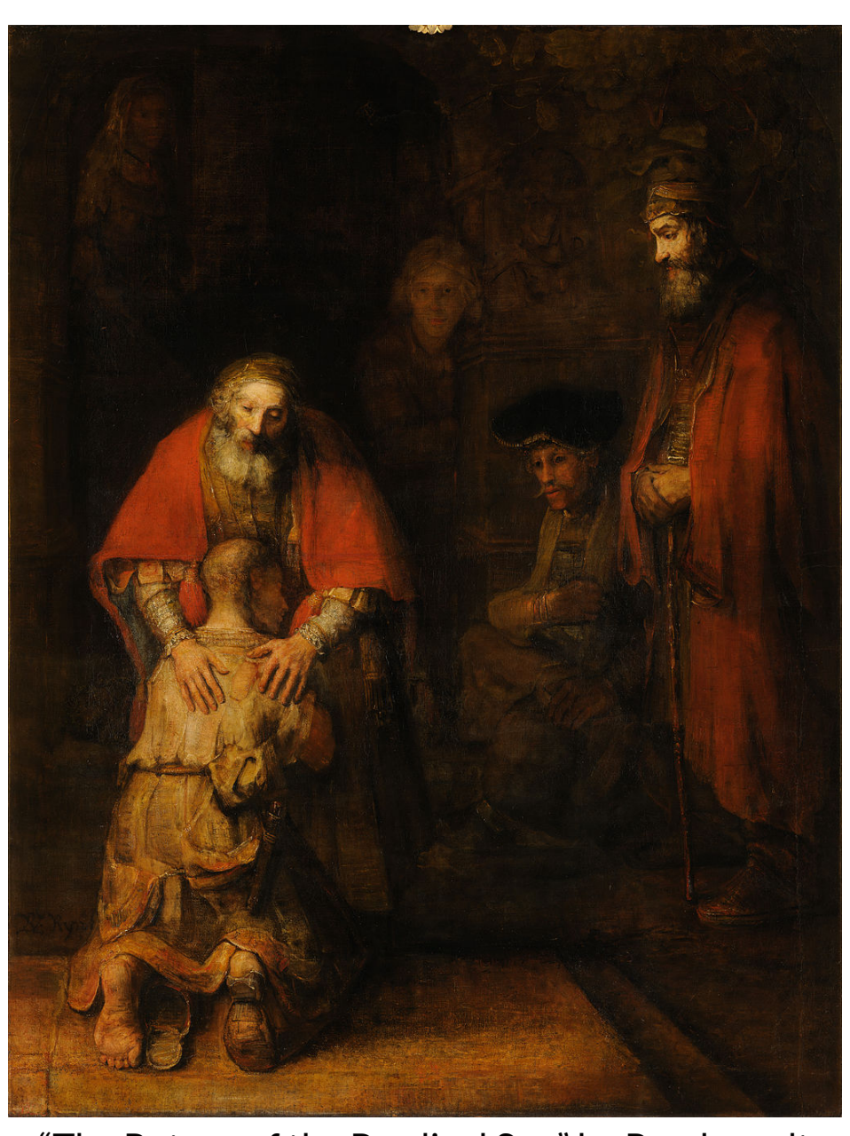
"The Return of the Prodigal Son" by Rembrandt