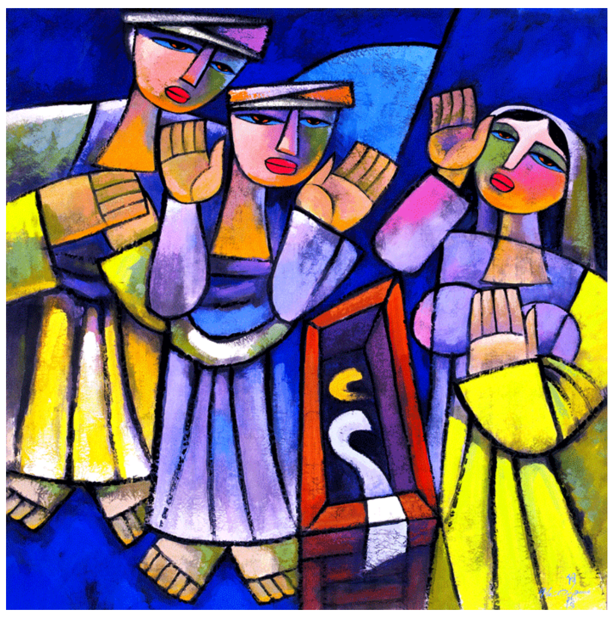
"The Empty Tomb" by He Qi