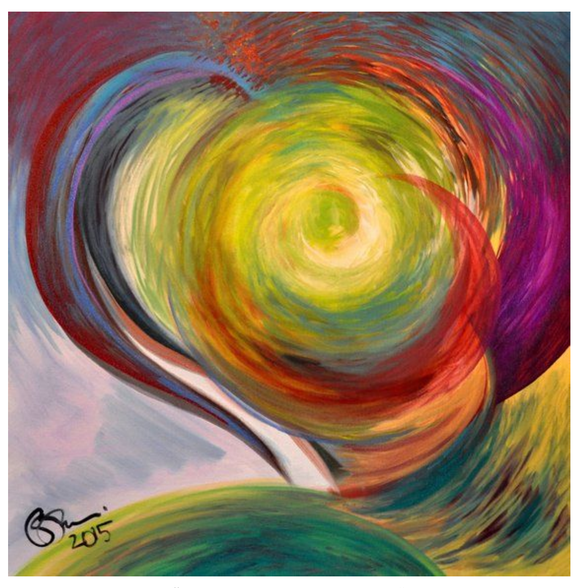
"Open Heart, Open Soul"