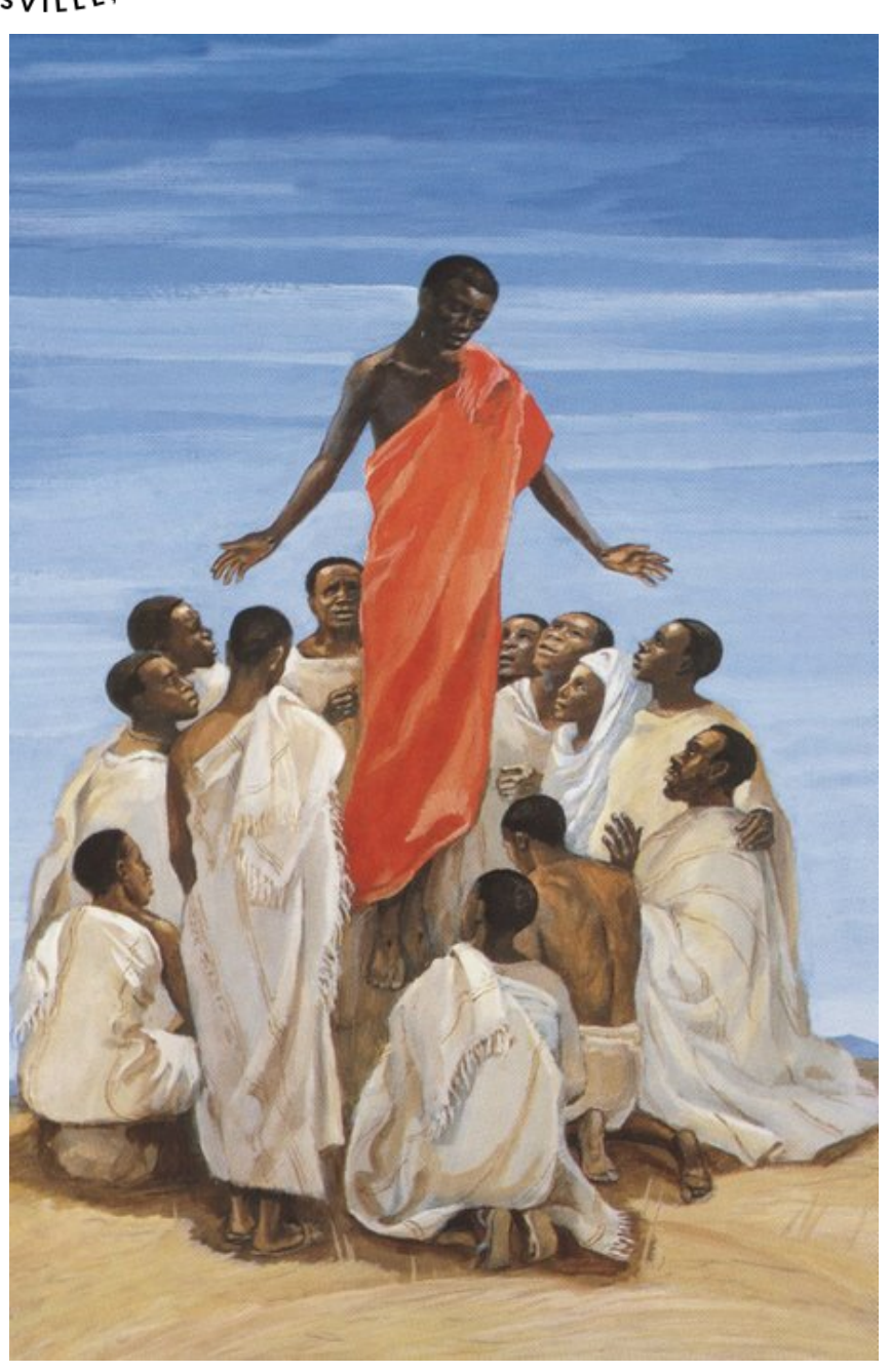
"The Ascension" by Jesus Mafa, Cameroon