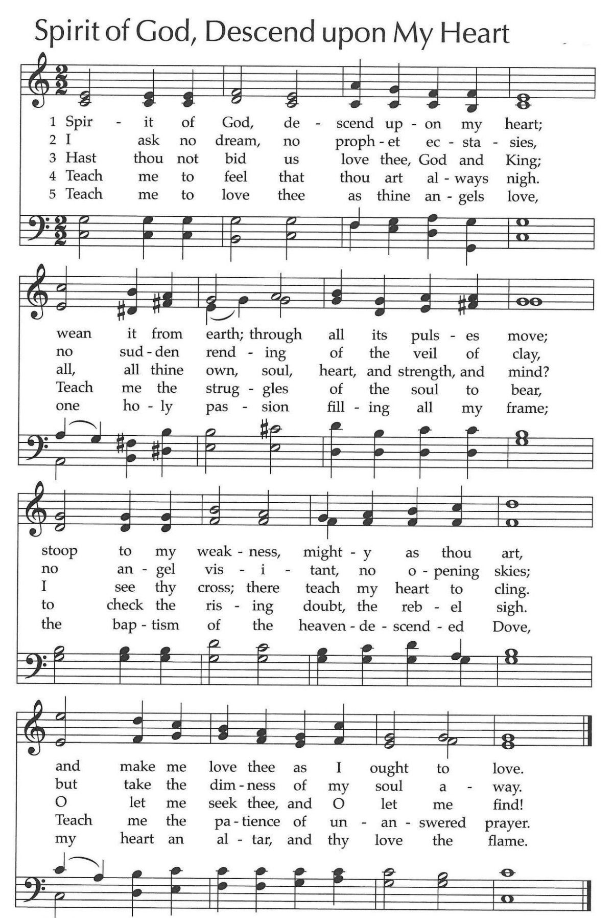
This reflection on Galatians 5:25 was written by a literary Anglican clergyman whose preaching drew people of many social classes to one of the formerly poorer London churches. The tune was created for "Abide with Me" (no. 836) but more often appears with the present text.