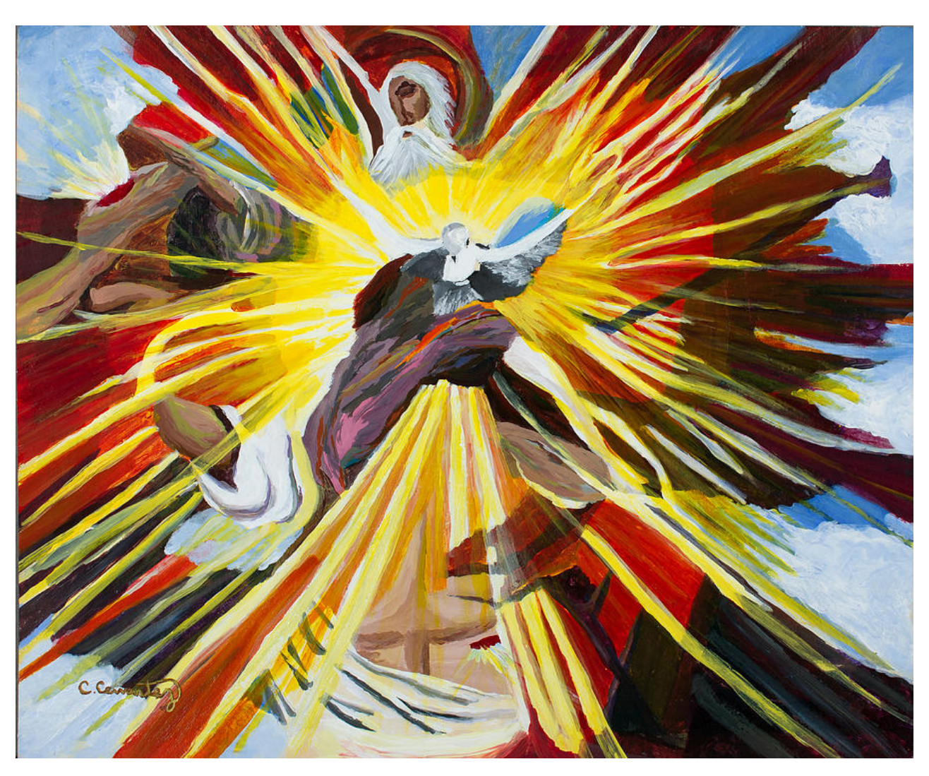
"La Santisima Trinidad" ("The Holy Trinity") by Candelario Cervantez