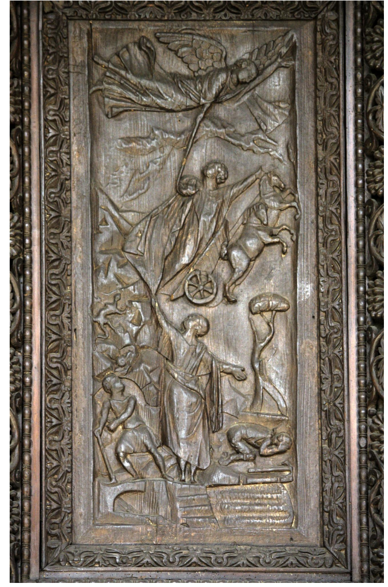
"Ascension of Elijah" (c.432) Carved in the doors of the basilica of Santa Sabina in Rome