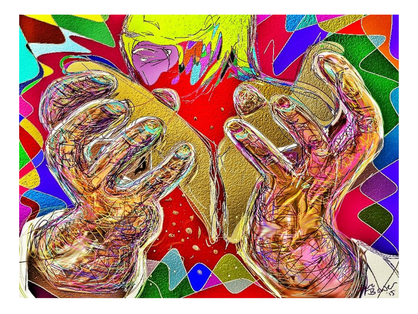
"Broken - For You" by Claire Bower