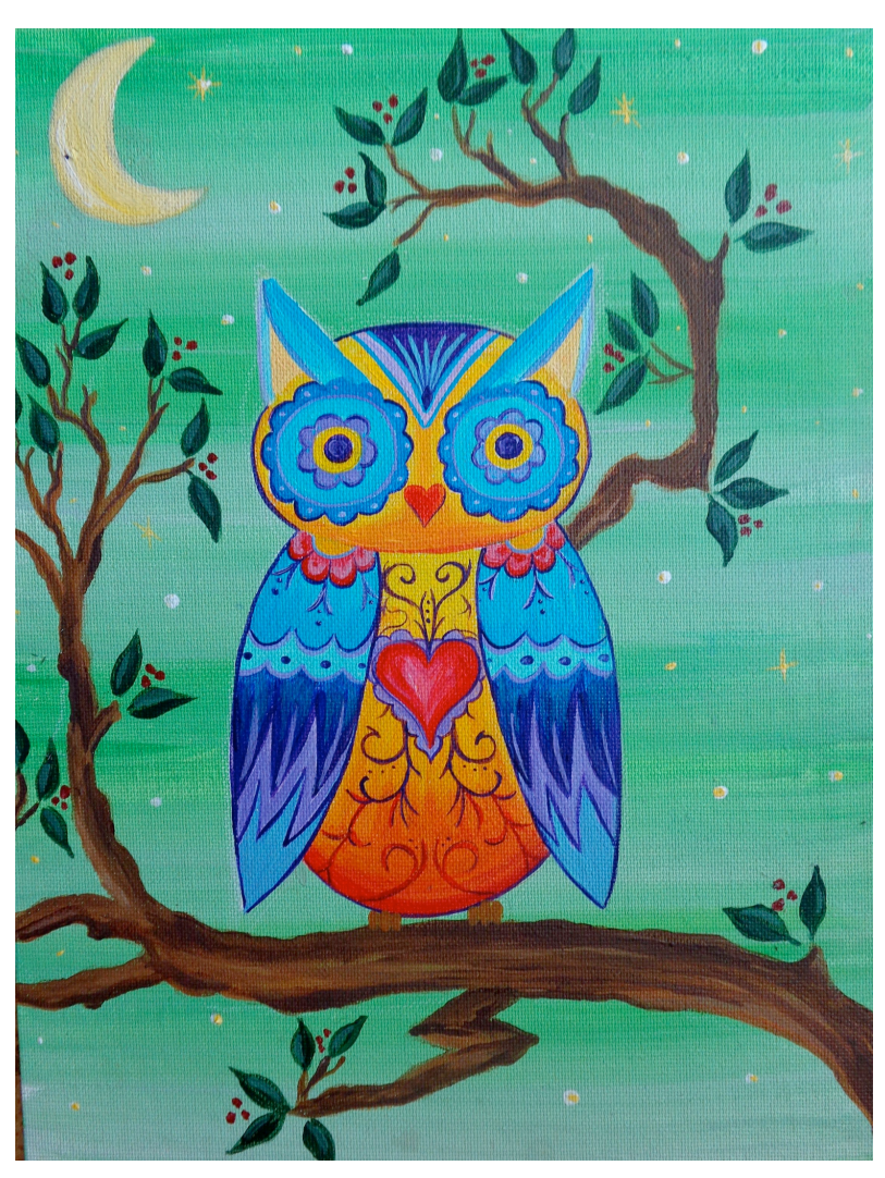
"Owl" by Kimberly Leahey