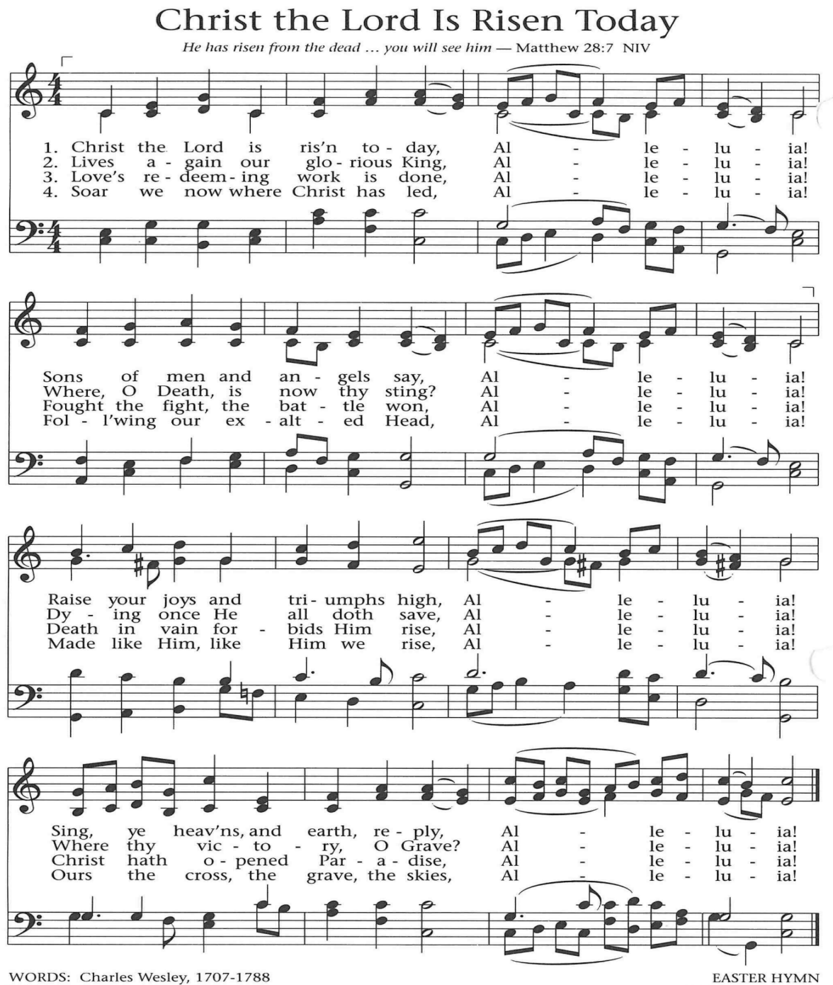
MUSIC: Lyra Davidica, 1708