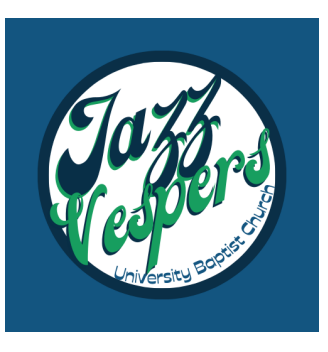
Mark Your Calendars!

Another opportunity to attend Jazz Vespers!