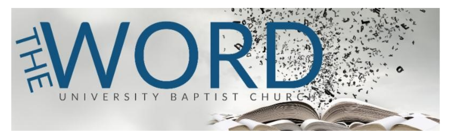
April 15, 2025 Vol. 77, No. 15