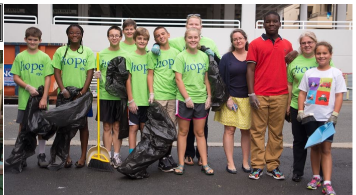
This past Sunday morning, youth and parents grabbed trash bags and plastic gloves and cleaned up the streets adjacent to the church.