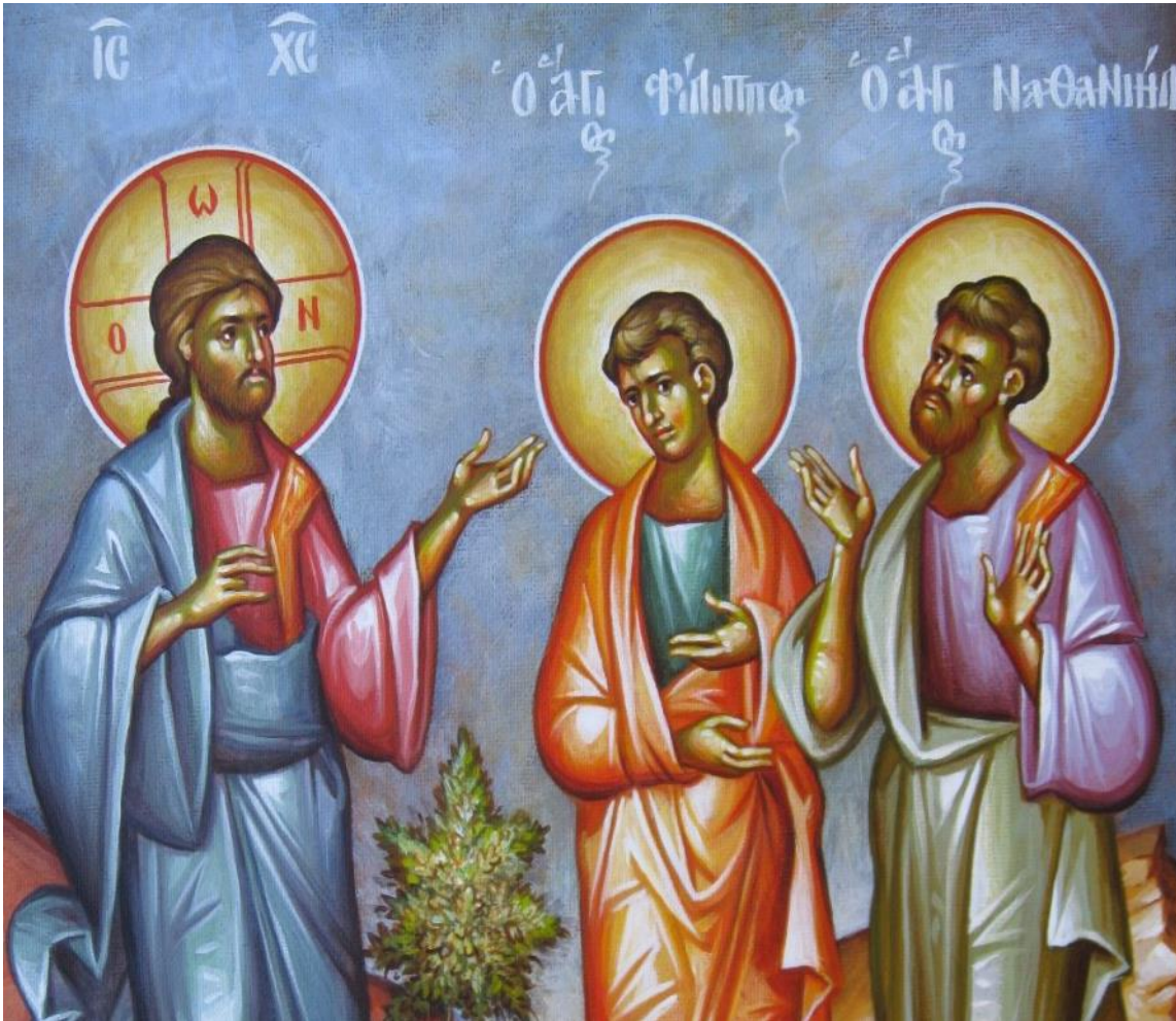
Jesus Calls Philip and Nathaniel