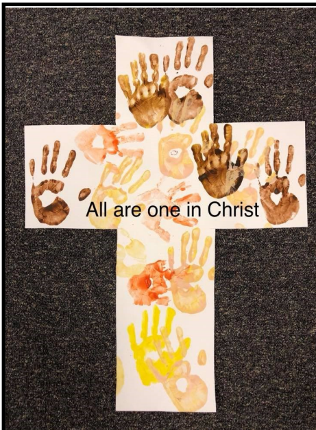
Our children’s reflection on the July 22 worship theme, “We are united in Christ.”