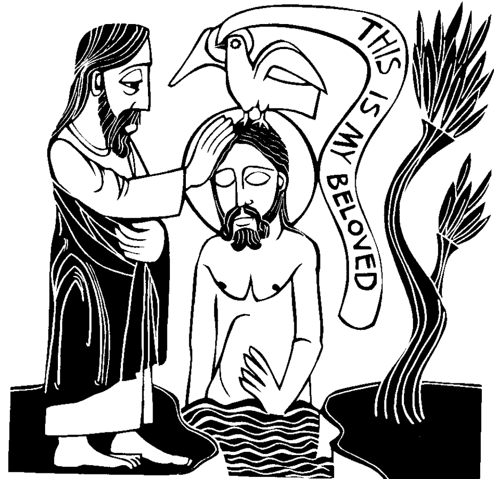
"Woodcut of Jesus Baptism"

God has called University Baptist Church to minister to the University Community and to the residents of the Greater Charlottesville-Albemarle Community, serving as agents of Christ's love and justice for those in need and offering a vital family of faith.