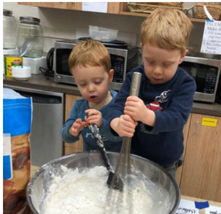
Family PACEM Prep Day January 20, 12:00 pm

Also, be listening and looking for opportunities to volunteer to help with laundry, stay overnight, set up and take down cots, and pick up linens from the Haven. This ministry takes many hours and many hands. The signup board is outside the office in the lobby. Thank you for your support!