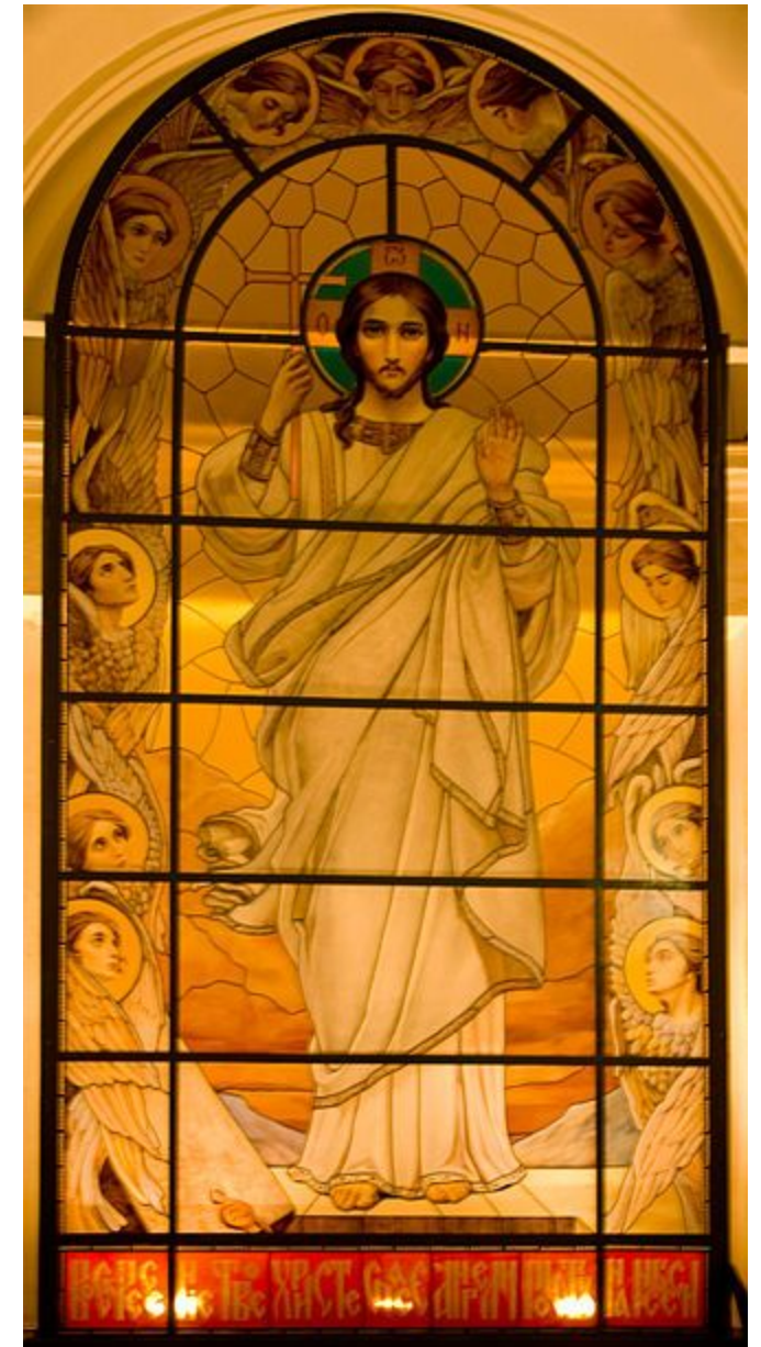
Peter and Paul Cathedral, St. Petersburg, Russia

WORSHIP OF GOD IN CHRIST April 28, 2019 11:00 AM