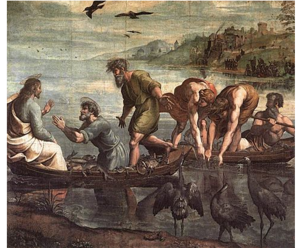
Jesus appears to the Disciples by the Lake Tiberius Raphael (1515)