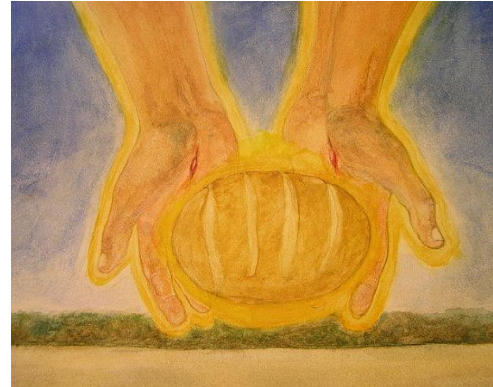
"Bread from Heaven" by Nigel Wynter