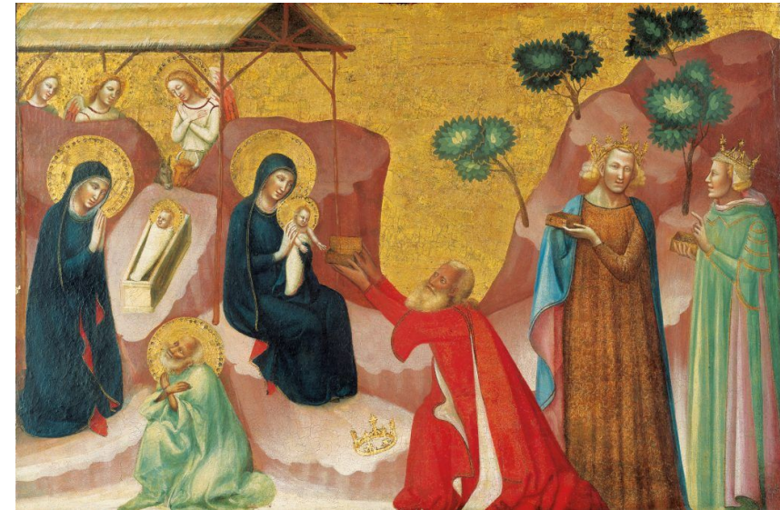
“The Nativity and the Adoration of the Magi” Pseudo-Jacopino Di Francesco 1325-1330