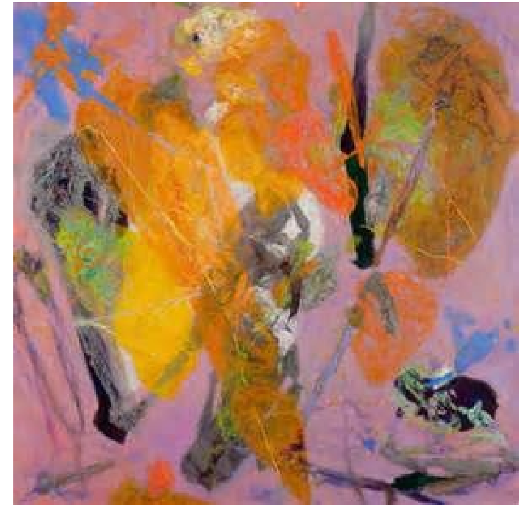
“Transfiguration” by Charles Emerson