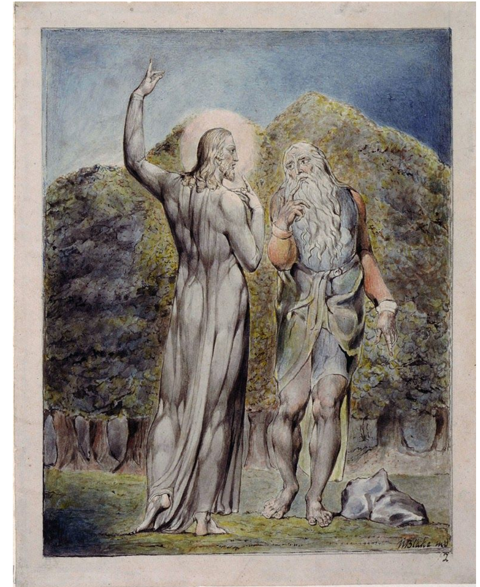
"The First Temptation" William Blake