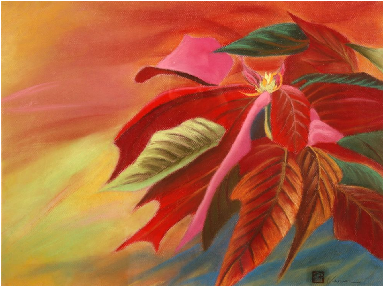
“Holiday Greetings” by Vina Yang