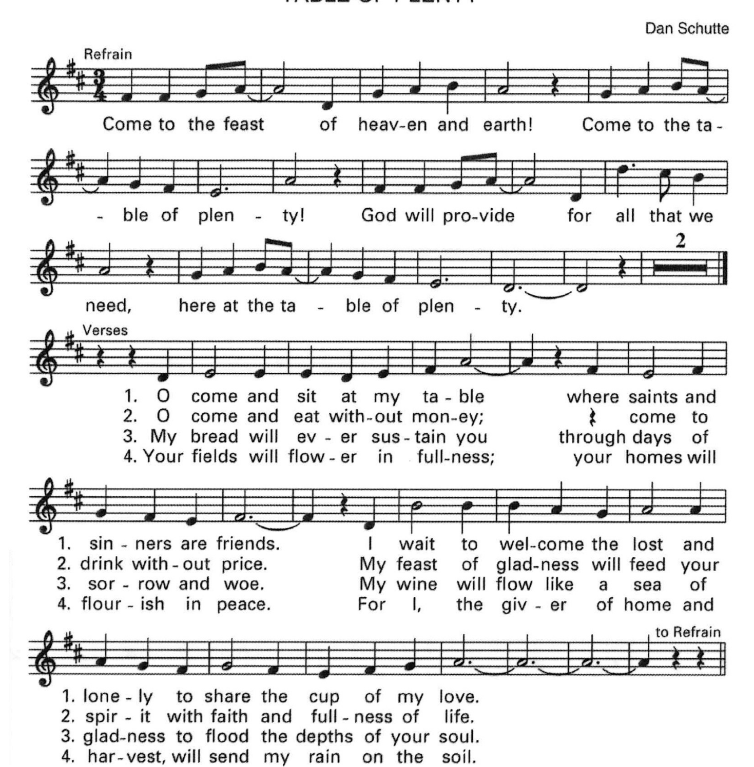
TABLE OF PLENTY

Text and music © 1992, Daniel L. Schutte. Published by OCP Publications, 5536 NE Hassalo, Portland, OR 97213. All rights reserved.