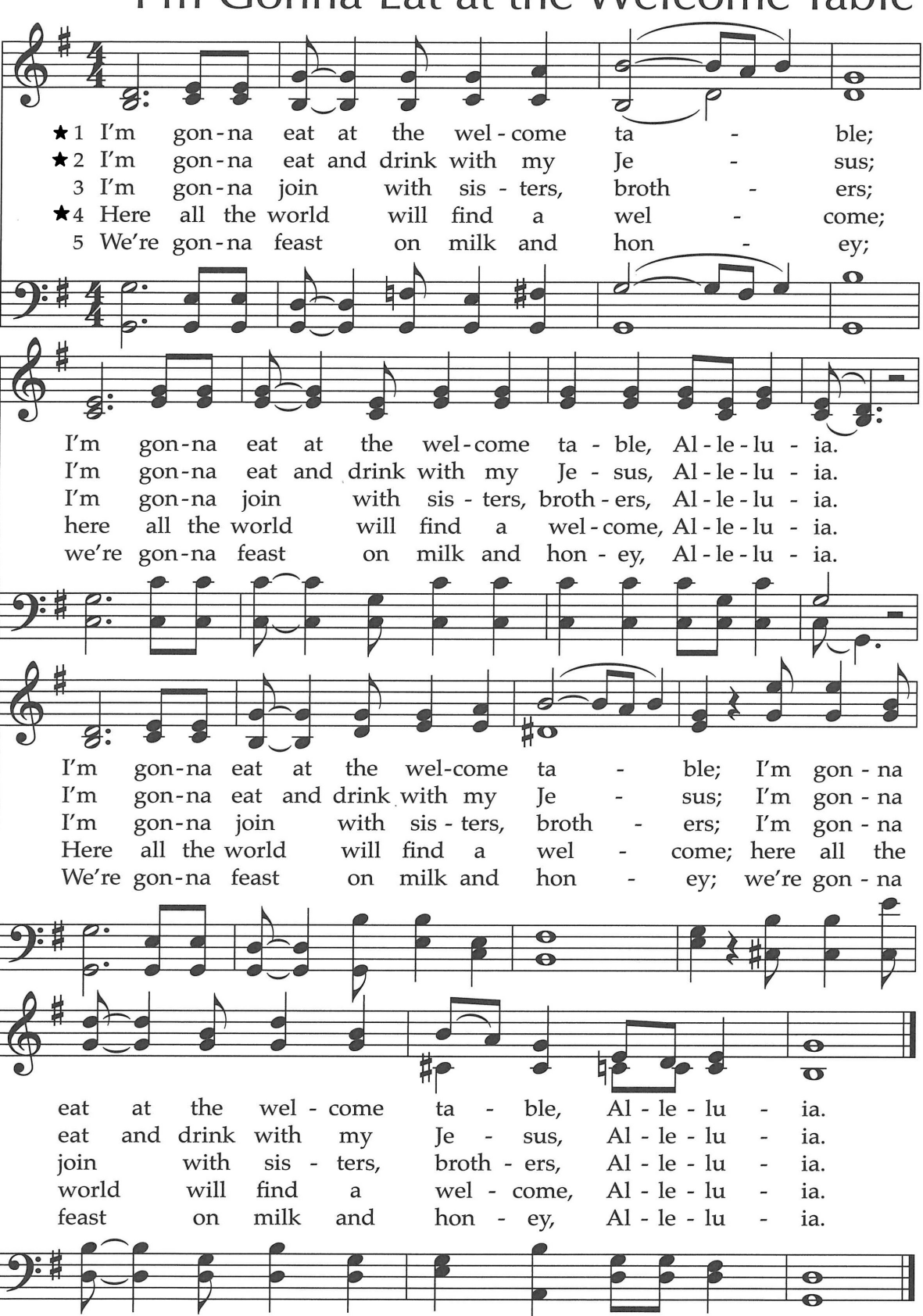
The image of a great feast showing God's welcome of all people was part of Jewish tradition (Isaiah 25:6–9) and underlies Jesus' parable of the Great Banquet (Luke 14:15–24). Such equality remains as unknown to many people today as it was to the slaves who created this spiritual.