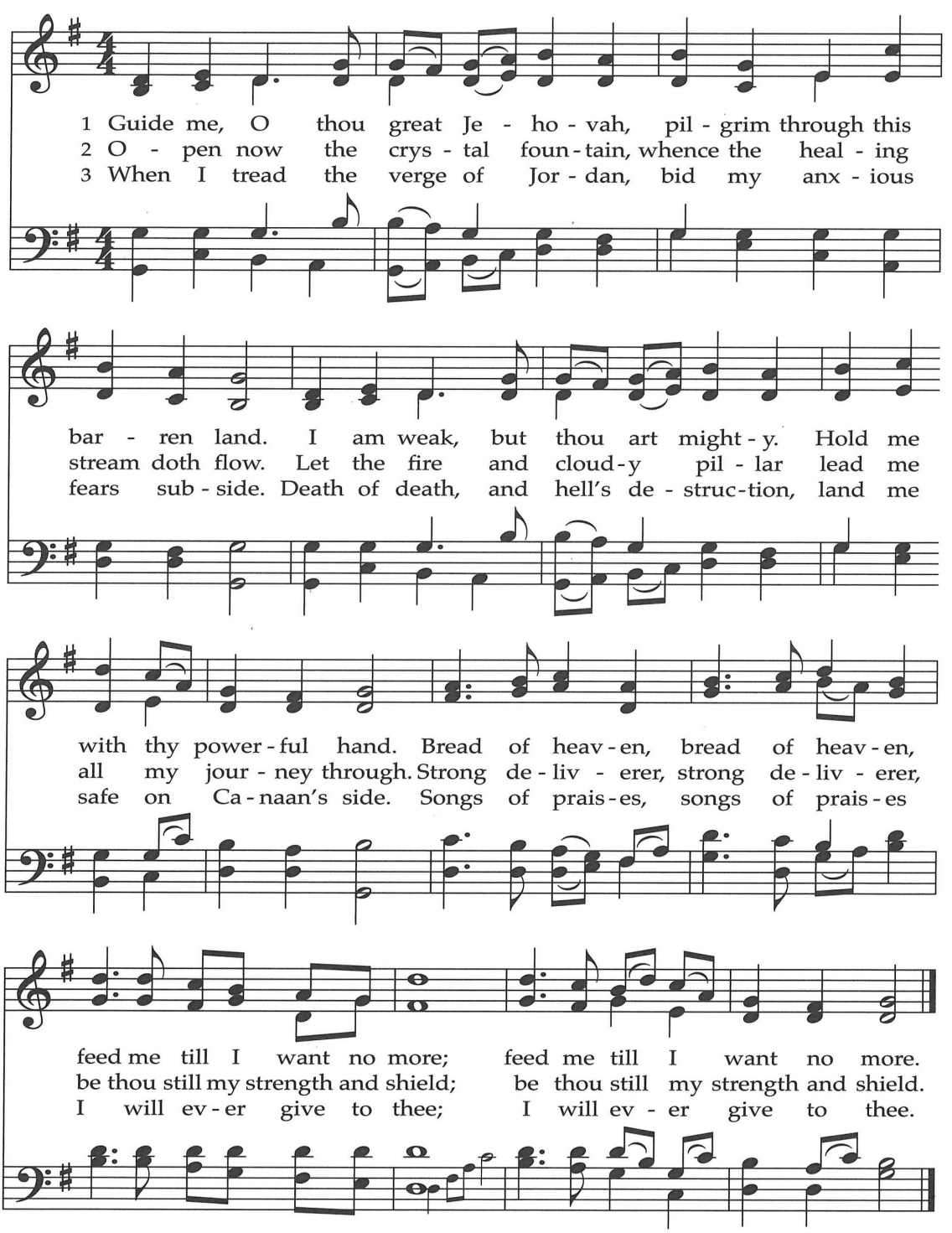
Few Welsh hymns are as well known or loved as this 18th-century text that did not gain its popular tune until the early 20th century. In both its original text and in English translation, it is a stirring hymn of pilgrimage filled with vivid imagery from Hebrew Scripture.