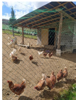
5 quails, 40 hens, & roosters