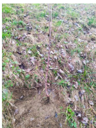
Our first apple tree